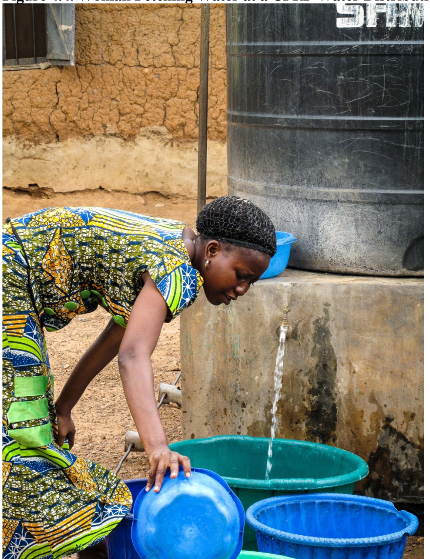
Figure 4.4. Woman Fetching Water at a CPRP Water Distribution Point, Kwara State

indicate an 83 percent decrease in the number of minutes spent per day (from 95.7 to 16.4 minutes), and a strong decrease (-74 percent) in the cases of water-borne diseases as well. Associated with these improvements are a decrease in costs spent on water and a decrease in the number of women and children involved in water collection—see Figure 4.3. The benefits of water projects were immediately obvious from IEG observations on the ground. In Kwara, all water projects visited were strongly supported by the whole community (not only women), which established clear plans to raise money for maintenance and repairs. A borehole normally served 3-4 distribution points, which catered to the whole community and whose access was highly regulated to maximize benefits for all.