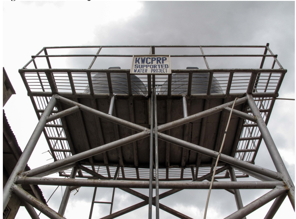
Figure 4.2. Water Project in Kwara State