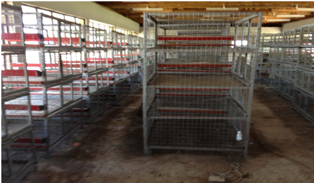
Photo 6: The upgraded Kuto Live Bird Market in Abeokuta was not yet in use