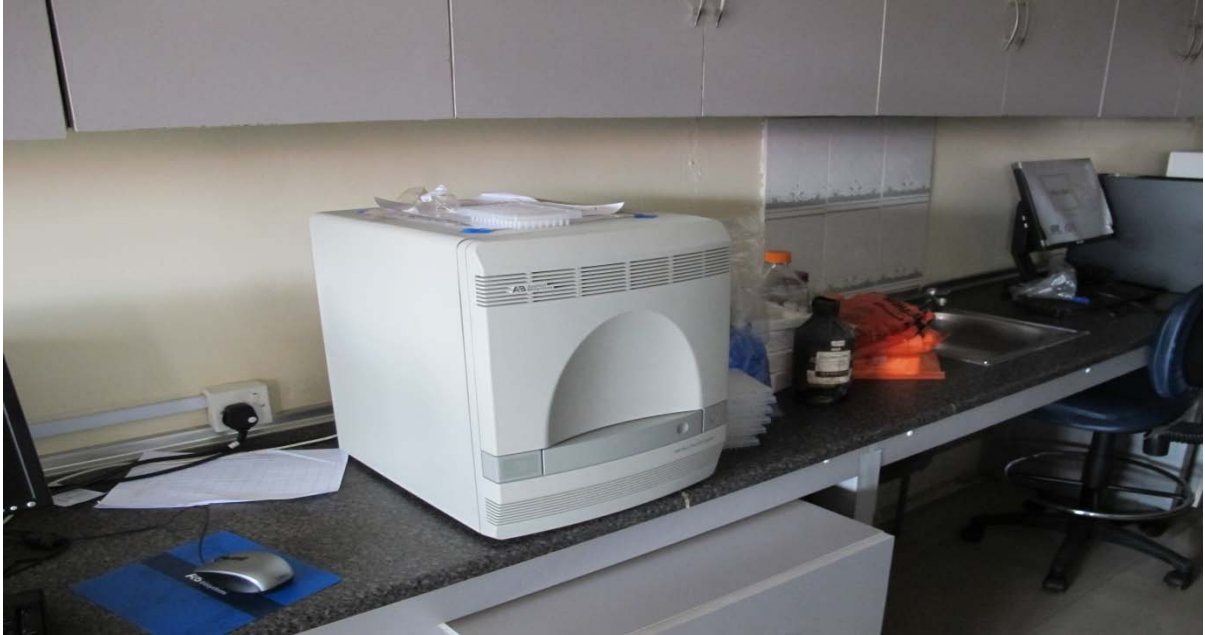
Photo 3: Some equipment for diagnosing influenza was in use at University College Hospital Department of Virology, Ibadan