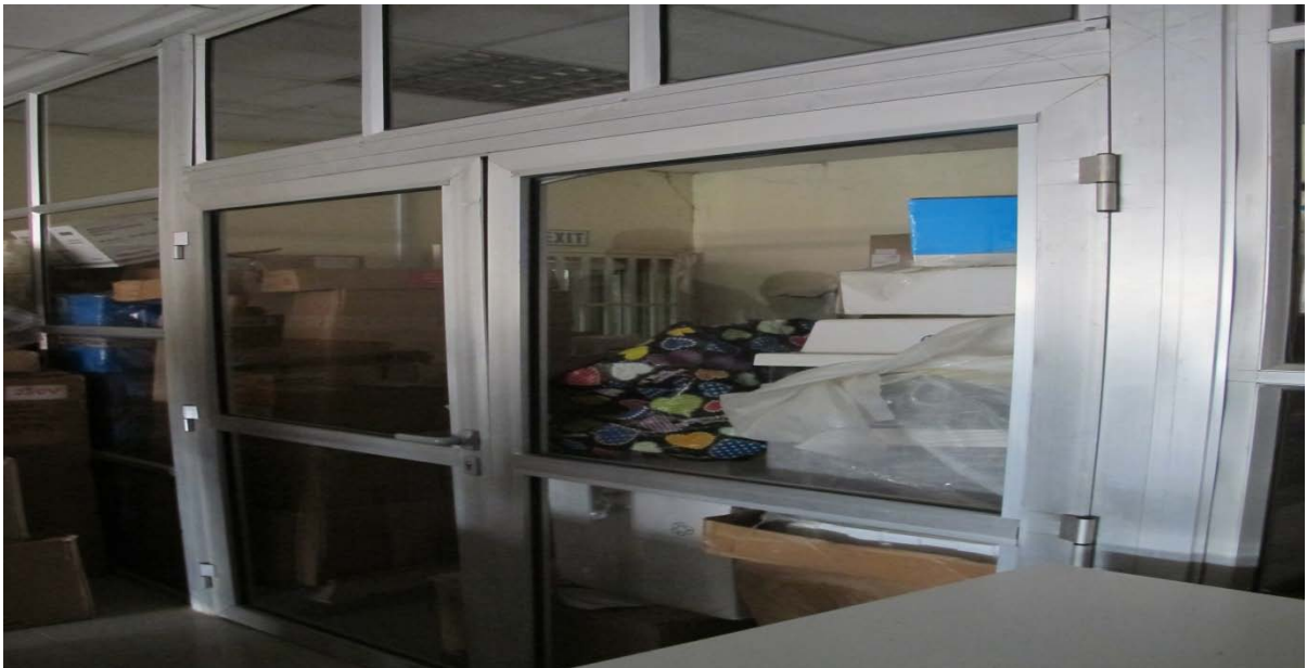
Photo 4: Roughly half of equipment supplied to University College Hospital Department of Virology, Ibadan, was not in use (in part because it duplicated existing equipment)