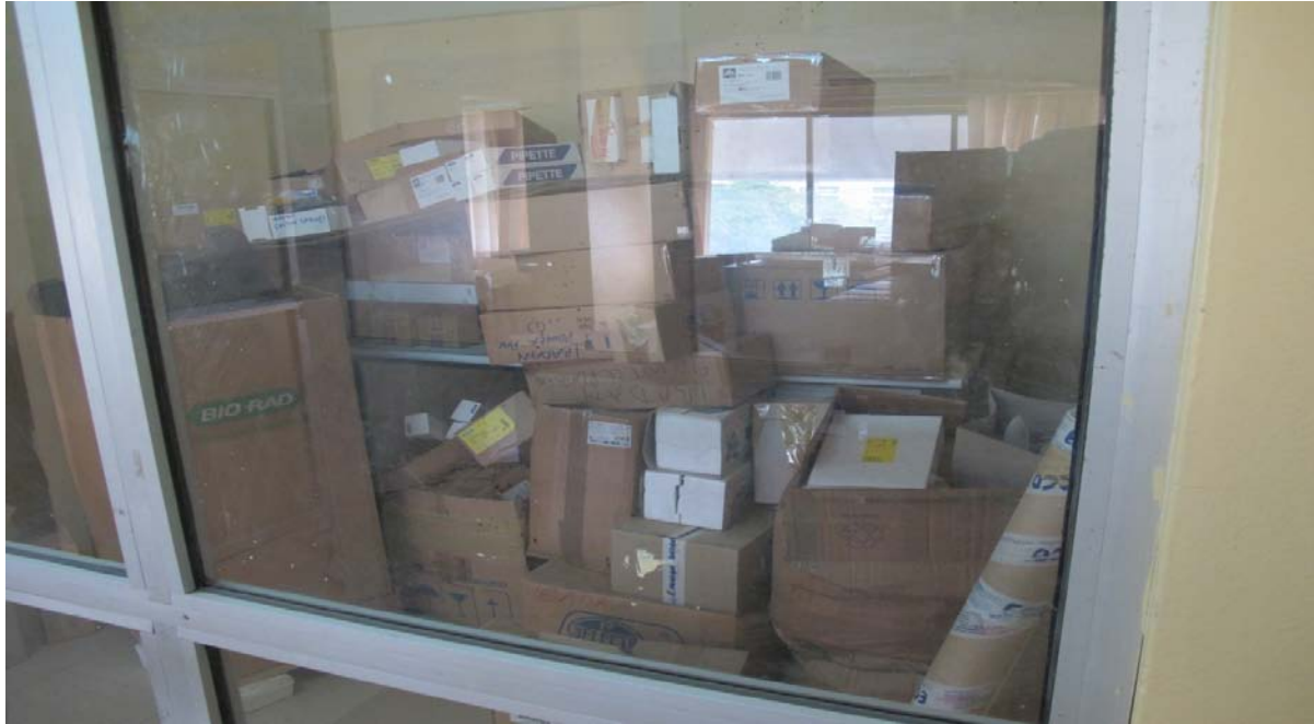
Photo 1: Equipment supplied to the Veterinary Teaching Hospital Ibadan was unused