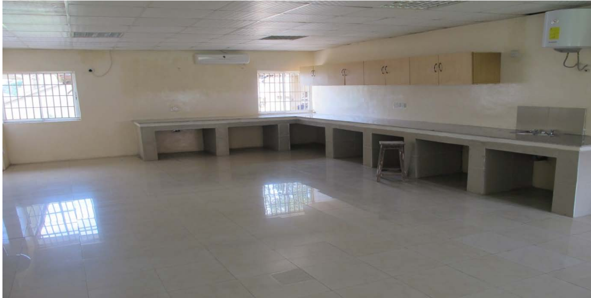
Photo 5: A new laboratory building at University College Hospital Department of Virology, Ibadan did not meet local requirements and was not in use 2 years after construction