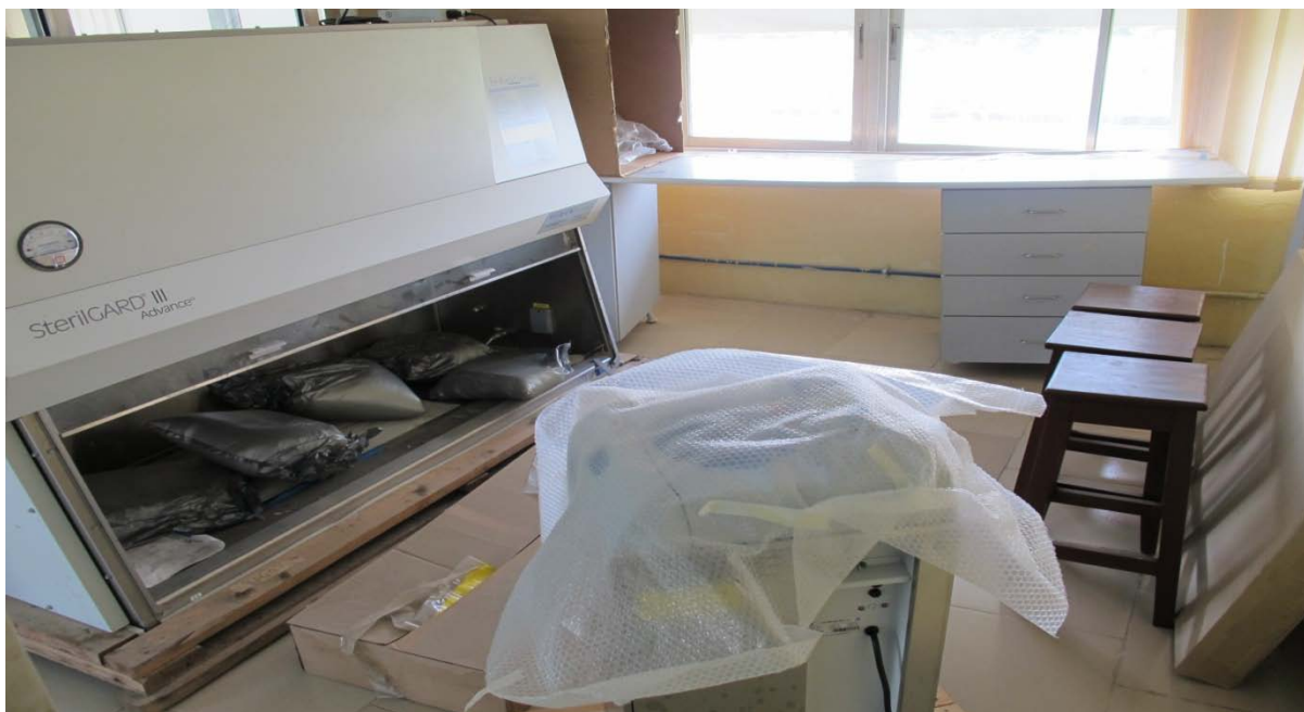
Photo 2: Influenza laboratory at the Veterinary Teaching Hospital Ibadan is not operational